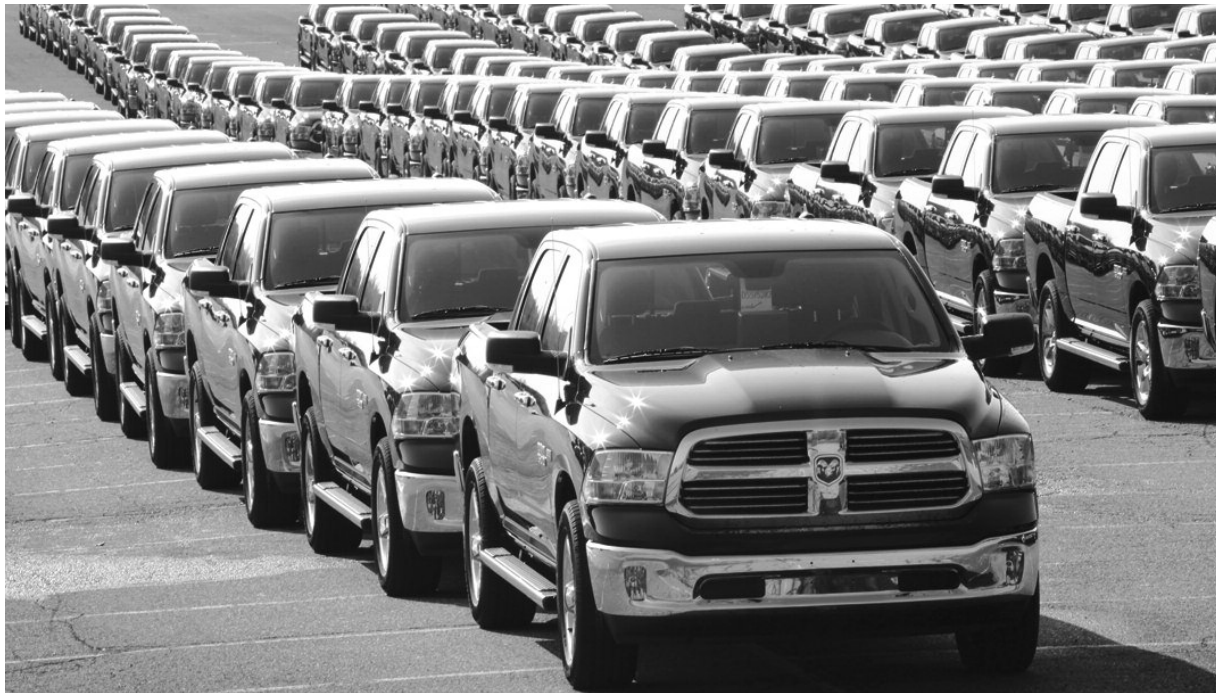
Nearly 200 new 2013 Ram 1500 Big Horn models recently awaited a drive-away with dealers from the Great Lakes area.